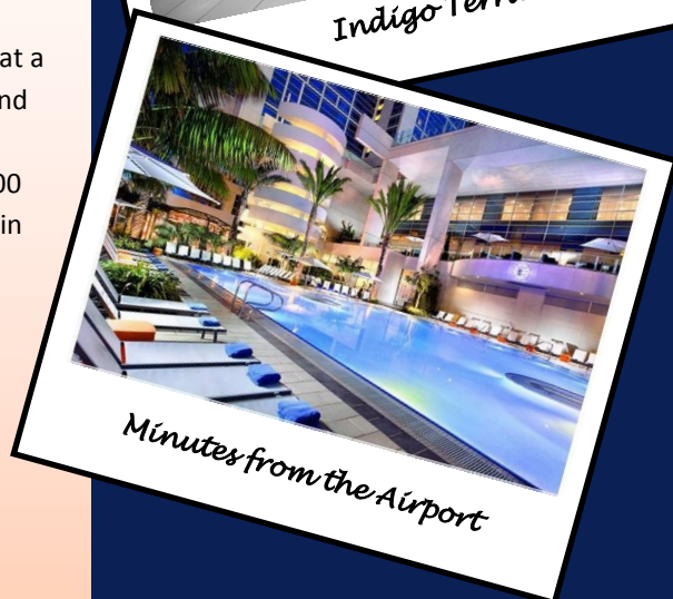
Minutes from the Airport