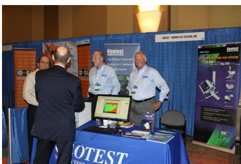
View Product Demonstrations