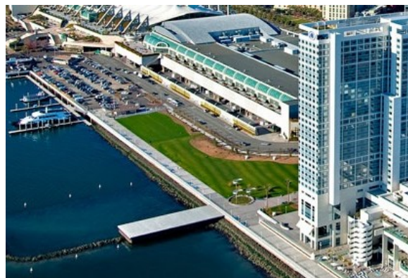
Hilton San Diego Bayfront