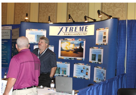
Discover New Solutions