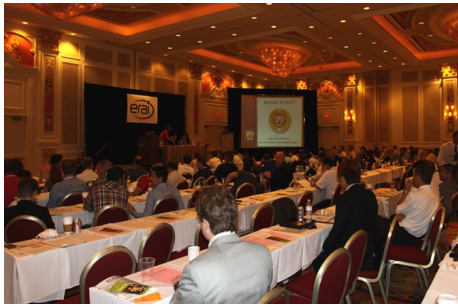
Learn from Industry Leaders