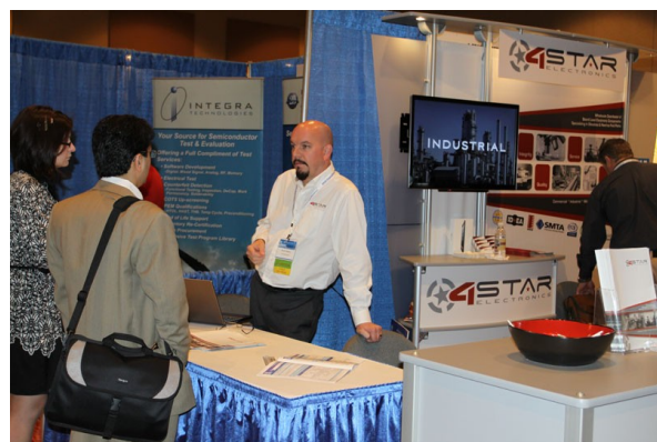
Reconnect with Suppliers and Colleagues

Meet the 2015 ERAI Conference Sponsors and Exhibitors at our Meet and Greet Exhibitor Crawl the evening of Tuesday, April 21 starting at 6:00 pm. Help us kick off the conference and enjoy drinks and appetizers provided by the exhibitors in Indigo Ballroom C.