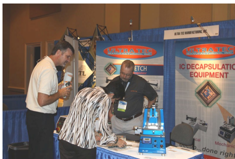
Gather Information and Ask Questions